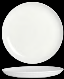
Coupe Plate 6900E439 D 11 3/4" 6900E440 D 10 1/4" 6900E441 D 8" 6900E442 D 5 3/4"

A well rounded balance of coupe plates, bowls, trays and mugs make up the Varick Bistro collection. Cost-friendly, modern and unique, Bistro is a perfect addition to any tabletop.