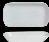
Rectangle Tray 6900E569 L 7 3/4" W 4 1/8" H 1" (10 1/2 oz)