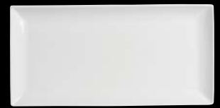
Rectangle Plate 6900E559 L 15" W 7" 6900E563 L 11" W 7" 6900E558 L 9 1/2" W 5"