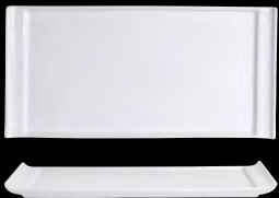
Handled Rectangle Tray 6900E404 L 13" W 6 1/2" 6900E405 L 11 3/4" W 5 3/4" 6900E407 L 8" W 4"