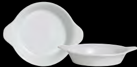
Shirred Egg 6900E434 L 8 1/4" W 6 5/8" H 1 1/2" (16 3/4 oz) 6900E435 L 7 3/8" W 6 1/4" H 1 1/2" (12 oz)