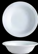
Grapefruit Bowl 6902JH4006 D 6 1/2" H 1 3/4" (12 oz)