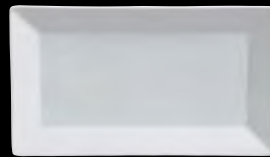
Rectangle Tray 6900E553 L 14" W 7" 6900E523 L 11" W 6" 6900E554 L 9 1/2" W 5" 6900E555 L 7" W 4 3/8"