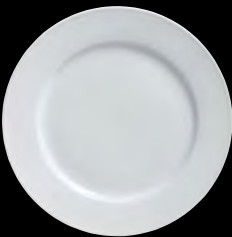
Plate 6900E500 D 12" 6900E501 D 11" 6900E502 D 10 5/8" (Plate Cover 5379S802) 6900E503 D 10" 6900E504 D 9" (Plate Cover 5379S790) 6900E505 D 8" 6900E506 D 6 1/2"