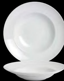
Presentation Bowl 6900E557 D 11 1/2" H 2 3/8" (17 oz) (Plate Cover 5379S789)