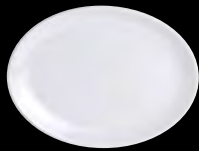
Oval Coupe Plate 6900E410 L 10" W 7 1/2" 6900E409 L 8" W 6"