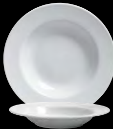
Pasta Bowl 6900E514 D 12" H 1 5/8" (13 oz) Rim Soup Bowl 6900E513 D 9" H 1 1/2" (10 oz)