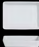
Rectangle Deep Tray 6900E580 L 6 7/8" W 5 1/8" H 1 1/4"