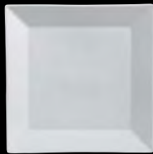
Square Tray 6900E524 L W 10 1/2" 6900E535 L W 8 1/2" 6900E536 L W 6 3/4"