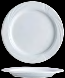
Plate 6902JH4001 D 10 1/2" 6902JH4000 D 8 3/4" 6902JH4007 D 6 1/2"

Encore is a stunning bright white porcelain that adds extra flair to your tabletop. Featuring a graceful curved embossment on a variety of classic shapes, Varick's Encore is the perfect option for any operator seeking a dependable product at a value price.