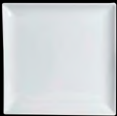
Square Plate 6900E537 L W 12" 6900E538 L W 10" 6900E539 L W 8" 6900E540 L W 6 1/2" 6900E541 L W 5 1/2" 6900E570 L W 3 1/2"

Varick's Pub collection provides geometric squares and rectangles for a casual tabletop presentation, geared toward the trendy gastropubs, microbrews and taphouses. Perfect for shared plates, snacks and appetizers, Pub provides a breadth of unique possibilities.