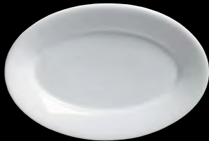
Platter 6900E518 L 15 1/2" W 10 3/4" 6900E519 L 13 1/4" W 9" 6900E520 L 11 1/2" W 7 3/4" 6900E521 L 10" W 6 3/4" 6900E522 L 8 1/4" W 5 7/8" 6900E430 L 7" W 4 1/2"