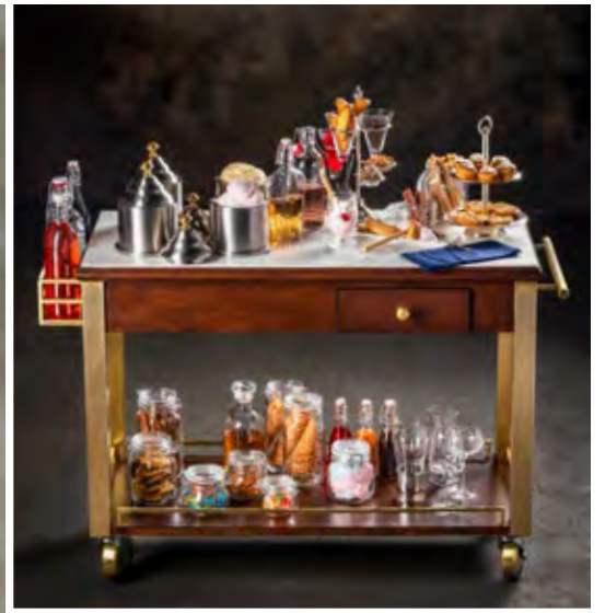
Ice Cream Cart Model: 7-1100 Size: 42" L X 20" W X 33" H Overall 46" L