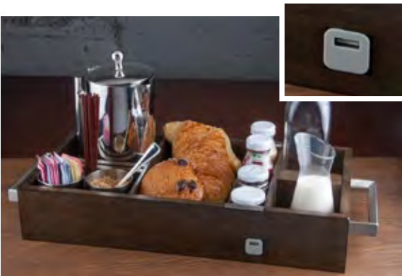
Breakfast Box w/ built-in USB Charger

*Also available in Stainless Steel Model: 2-1438R