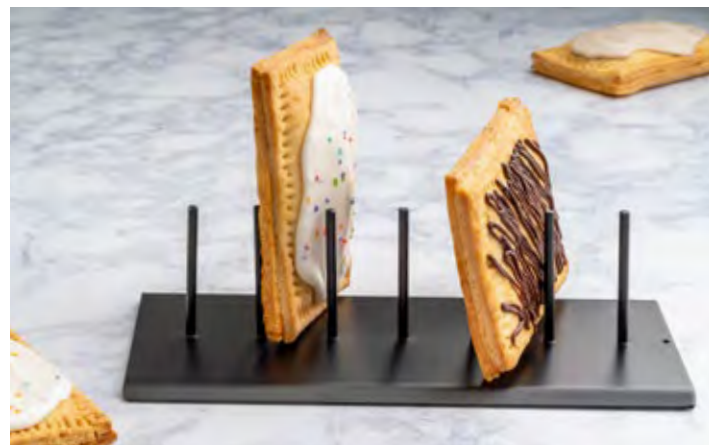
Black Powder Coated Rectangular Display Stand Model: 2-2163B Size: 10" x 5"