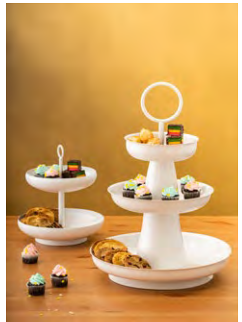
Three Tier Tower w/ Ring Handle