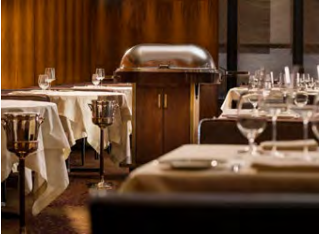
Carving Trolley , Model: 7-6206, Size: 38" L x 24" W x 45" H