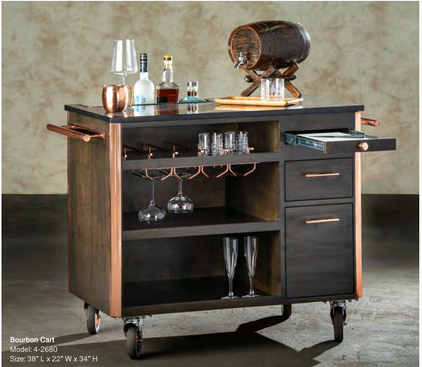
Bourbon Cart Model: 4-2680 Size: 38" L x 22" W x 34" H

Available with Stainless Steel, Brass or Copper plated accents. Bourbon Barrel not included. Pull out with white composition recessed cutting board.