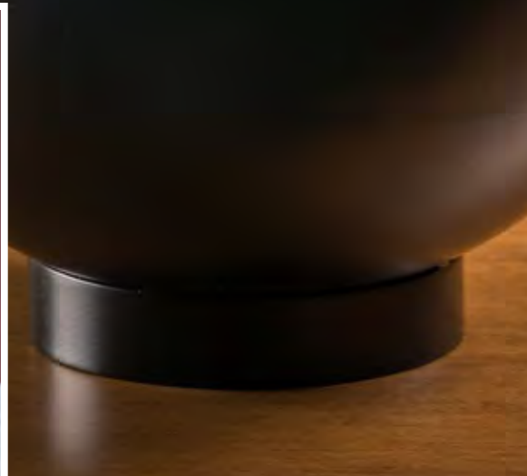
Black Powder Coated Punch Bowl Model: 2-1916-14B Size 14" D