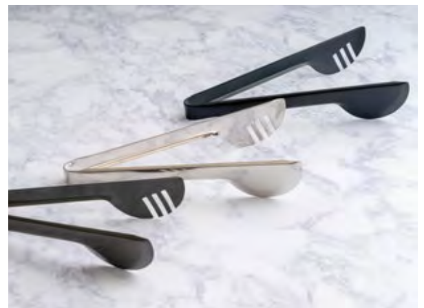
Stainless Steel Serving Tongs Model: 2-3205, Size: 9 1/2" L *Available in custom colored powder coated (with minimum order).