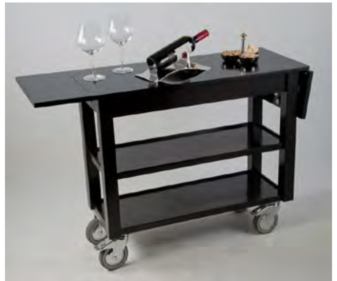
Guerridon Model: 2-2600 Size: 36" L x 16" W x 31", H Overall: 52" L