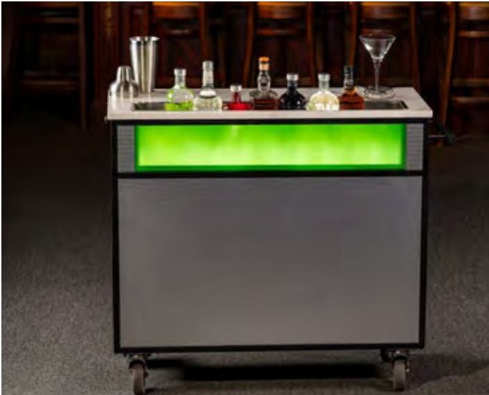
Mixology Cart Model: 8-2688 Size: 3 1/2" L x 16 1/2" W x 36" H