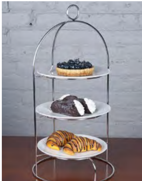
Three Tier Etagere Model: 2-1577 Holds 6" – 8" Plates Size: 20" H