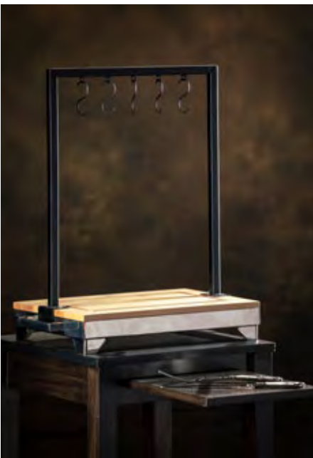
Tomahawk Steak Carving Board Display

Size: Top Tier: 6 3/4", Bottom Tier: 8", Overall: 12" H