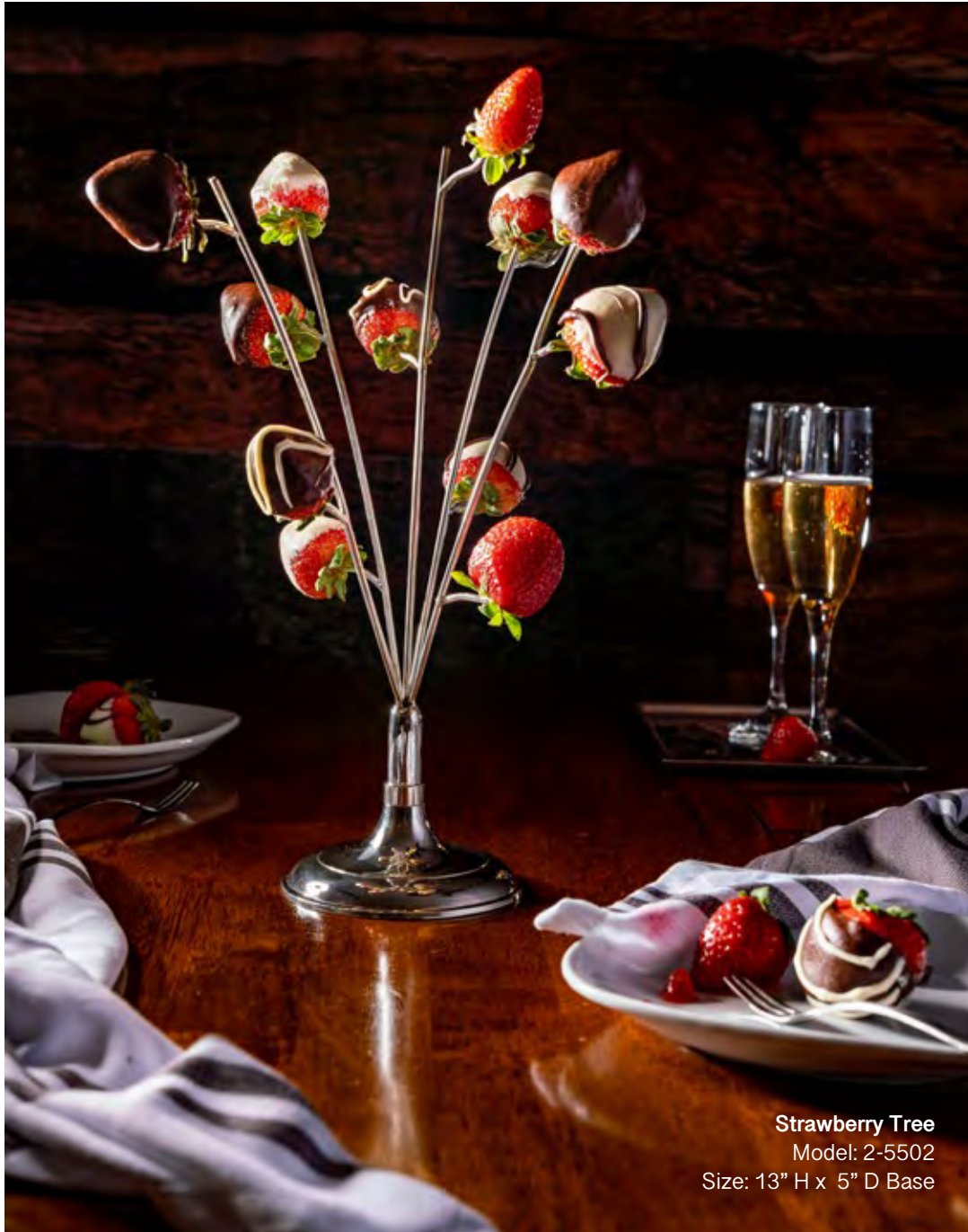
Strawberry Tree Model: 2-5502 Size: 13" H x 5" D Base