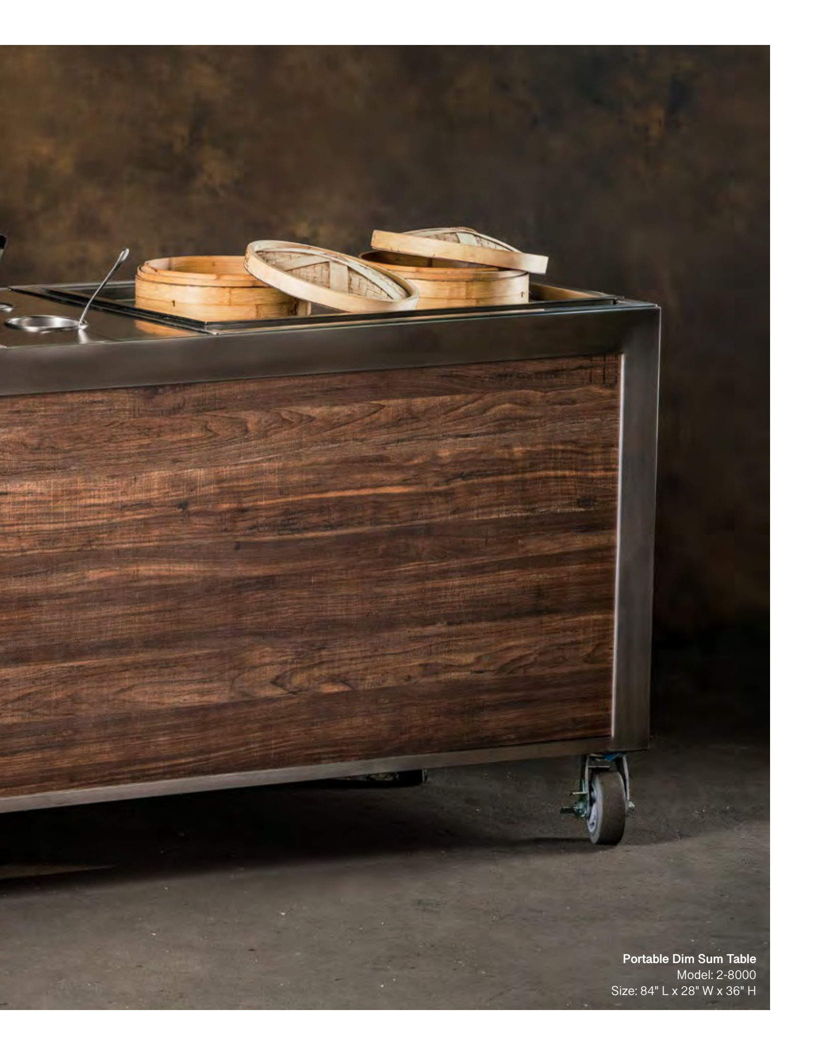
Portable Dim Sum Table Model: 2-8000 Size: 84" L x 28" W x 36" H