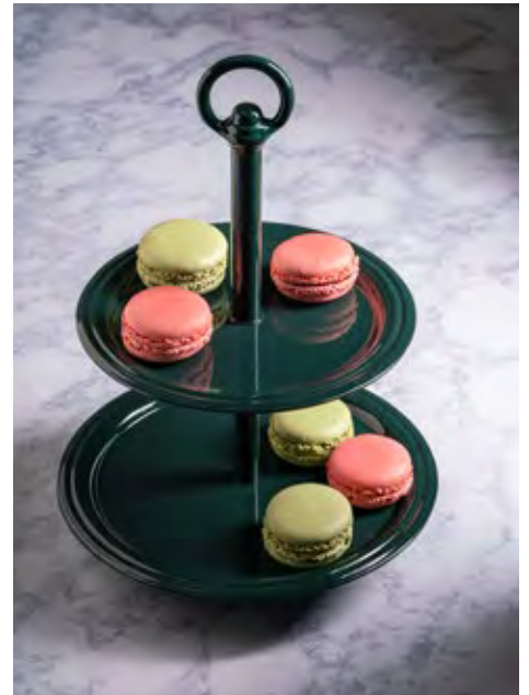
Two Tier Compote Stand

Size: Top Tier: 4 3/4", Bottom Tier: 5 3/4", Overall H 9"