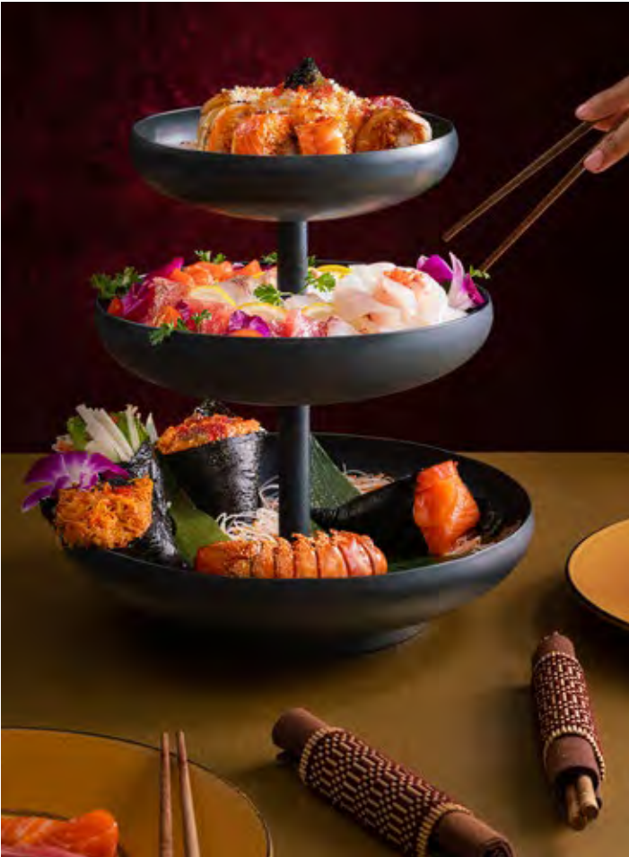
Three Tier Coupe Tower Powder Coated Model: 2-3202 Size: Overall 15 1/2" H Top Tier: 7 3/4" D, Middle Tier: 9 1/2" D, Bottom Tier: 11 1/2" D