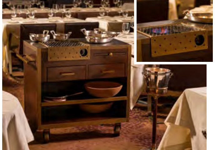
Flambe Cart , Model: 7-6207, Size: 35" L x 20" W x 34" H