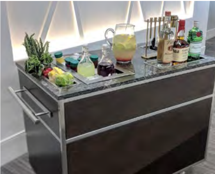
Bar Cart Model: 2-1818 Mercedes-Benz Stadium Atlanta, Ga. Size: 40" L x 24" W x 34" H