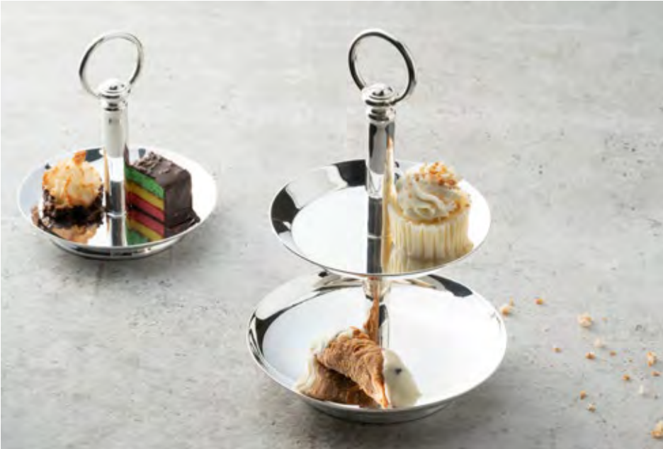
Single Compote Stand Silver Plate