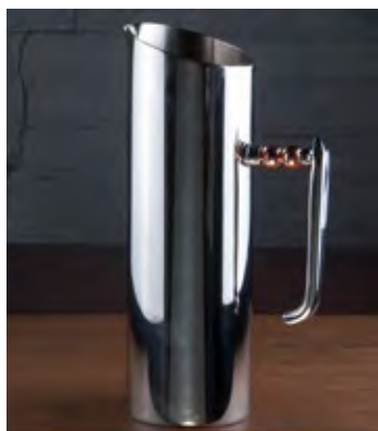
64 oz. Water Pitcher Model: 2-2012