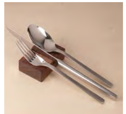
Walnut Flatware Rest