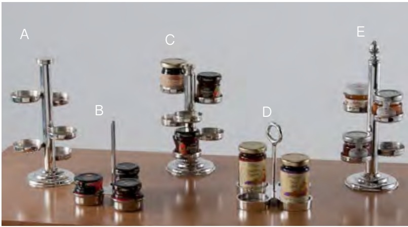
A. 2-3241 Jam Holder w/ Flat Knob D. 2-3251 Jam Holder w/ Loop Handle B. 2-3231 Jam Holder w/ Tubing Handle E. 2-3261 Jam Holder w/ Acorn Finial C. 2-3221 Jam Holder w/ Knob Finial