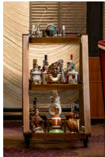
Liquor Cart w/ Floating Glass Model: 7-6215 Size: 28" L x 39" W x 43 1/2" H