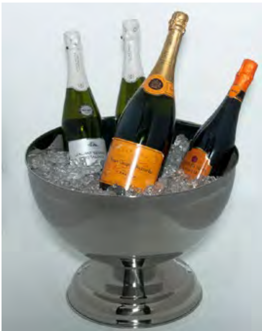
Banquet Punch Bowl Model: 2-1916-16 Size: 16" D