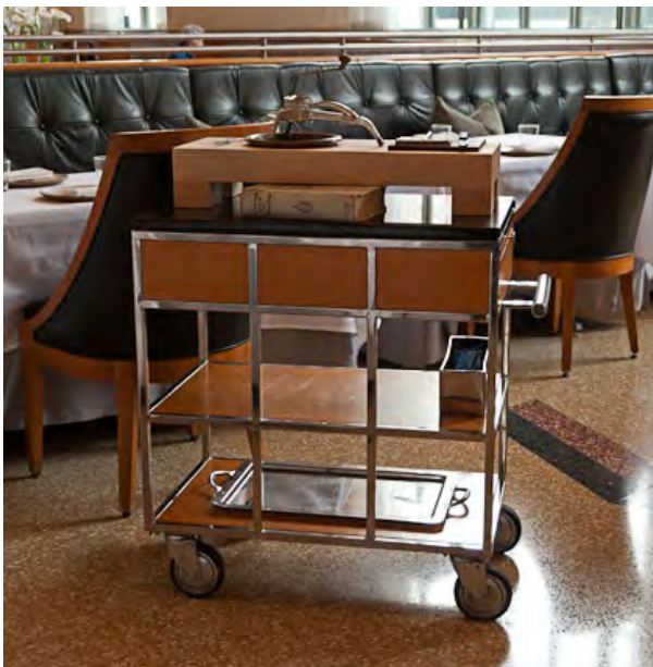
Waldorf Salad Cart