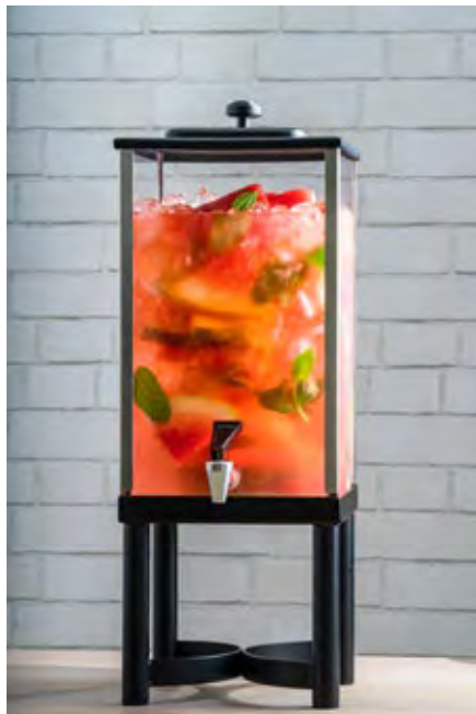
Black Powder Coated Square Juice Container Model: 2-9975B Size: 8" L x 8" W x 14" H, Overall H 20"