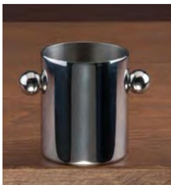
5 oz. Sugar Bowl Model: 2-2001