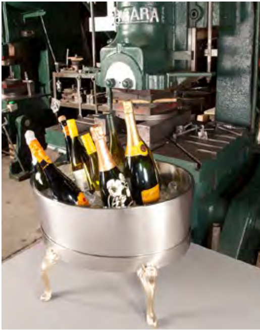
Insulated Tapered Oval Cooler w/ Stand Model: 2-2014 Size: Cooler 22 1/2" L x 17 1/2" W x 8 1/2" H Size: Stand 21 3/8" L x 15 5/8" W x 7 3/4" H