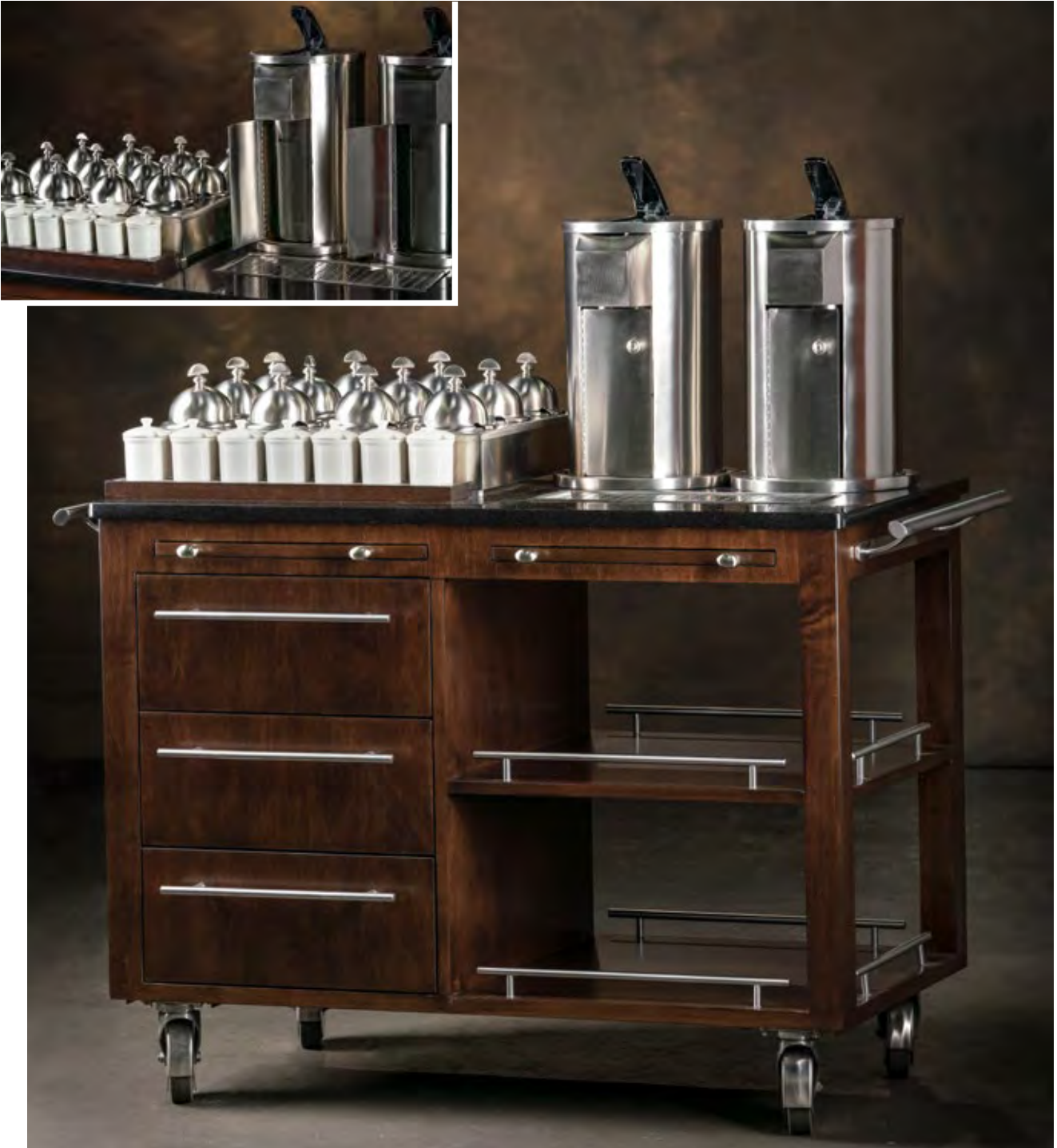
Tea Cart Model: 8-1717 Size: 43" L x 23" W x 34" H