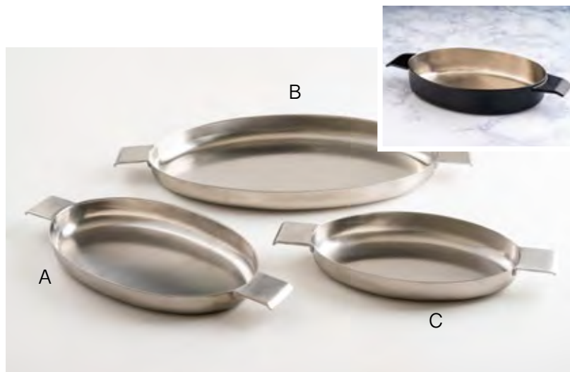
A. 2-3065 Medium Oval Casserole 12 1/4" x 7 1/4" x 1 1/2"