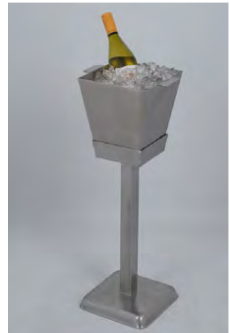
Square Wine Cooler Model: 2-4040, Size: 8" L x 8" W x 9" H Square Stand Model: 2-4041, Size: 27" H