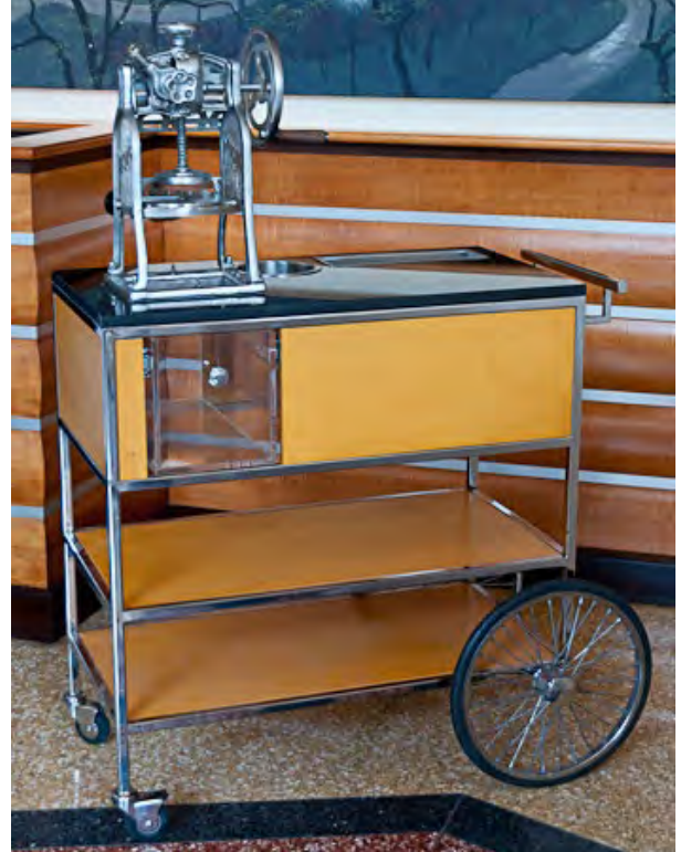
Ice Shaving Cart