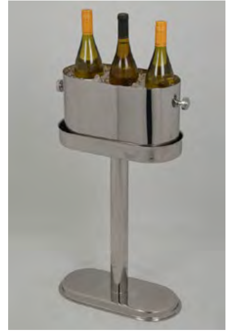
Three Bottle Wine Station Model: 2-4004 Size: 13" L x 6" W x 7 3/4" H Oval Stand Model: 2-4005 Size: 20 1/2" H