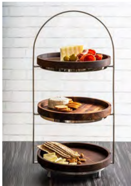
Three Tier Stand