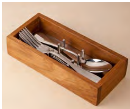
Teak MEP Box w/ Stainless Steel Insert