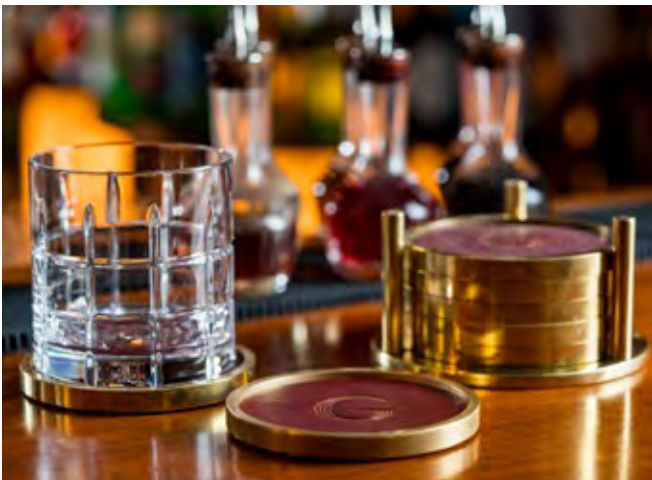
Stackable Brass Coasters Model: 7-1801 Size: 4" D