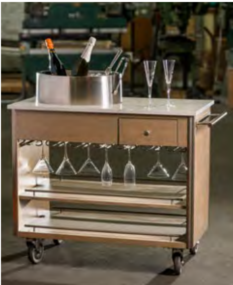
Champagne Cart Model: 2-3588 Size: 38" L x 20" W x 34" H