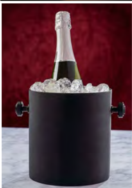
Black Powder Coated Wine Cooler Model: 2-4058B Size: 8" D