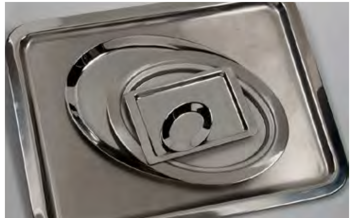
Oblong Tray Model: 2-1497PF, Size: 19" x 25" Oval Tray Model: 2-1516, Size: 8" Oval Tray Two Step Model: 2-1513PF, Size: 16" Rectangular Tray Model: 2-2161, Size: 8" x 5 1/2" Oval Butter Dish Model: 2-2801, *Available in many sizes.