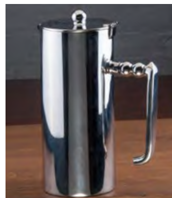
32 oz. Coffee/Tea Pot Model: 2-2003