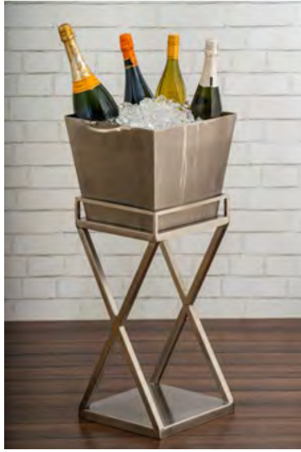
Large Square Wine Cooler Model: 2-4043 Size: 12" L x 12" W x 11 1/4" H Large Square Stand Model: 2-4044, Size: 22 1/2" H Overall H: 31 1/2"