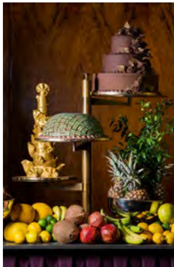
Custom Bronze Multi-Tiered Display Size: 36" Tall Rings: 15" & 18"