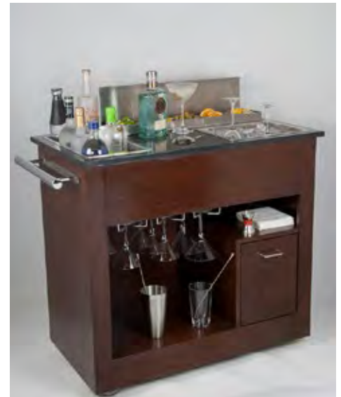
Martini Cart Model: 8-6101 Size: 38" L x 20" W x 34" H