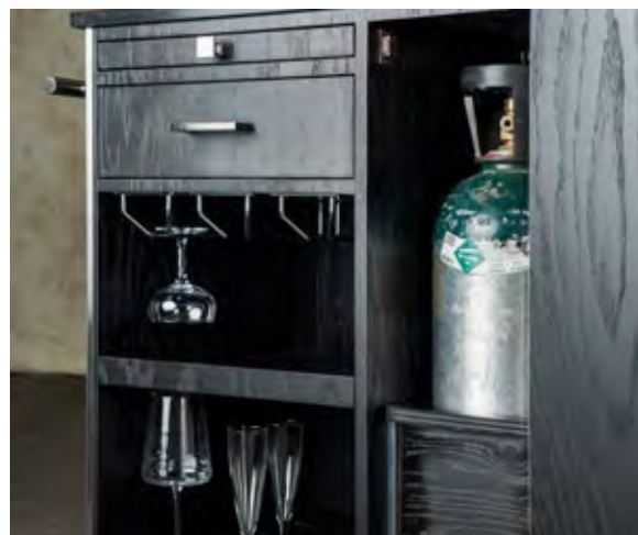
Recommended with CO 2 20lb Tank (not included)