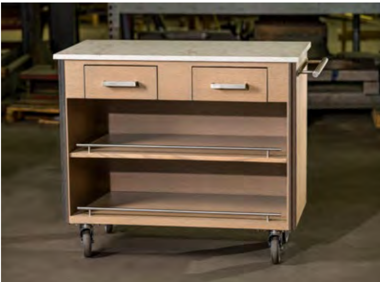
All Purpose Service Cart Model: 2-3589 Size: 38" L x 20" W x 34" H