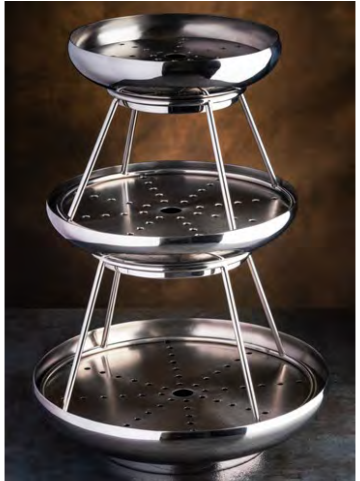
Three Tier Tower Model: 2-9998 Size: Top Tier: 7 7/8" D x 2 1/2" D, Middle Tier: 9 1/2" D x 2 1/4" D, Bottom Tier: 11 1/2" D x 2 3/4" D