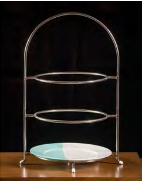
Three Tier Plate Holder Model: 2-1574 Holds 9" – 12" Plates Size: 22" H