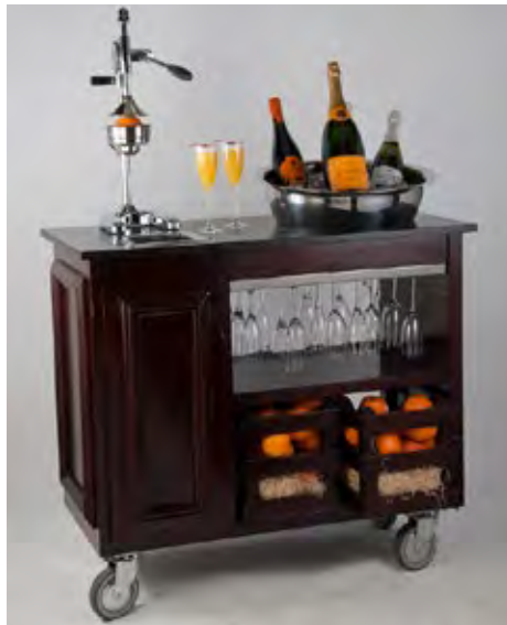
Mimosa Cart Model: 8-6121 Size: 38" L x 20" W x 34" H