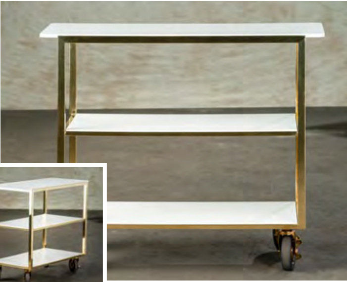
Brass Gueridon w/ Designer White Shelves Model: 7 -6222 Size: 36" L x 18" W x 32 1/2 " H H Overall: 33" L x 18" W x 26" L Frame