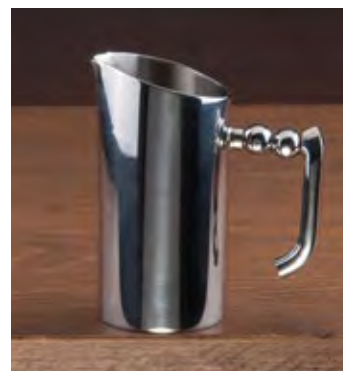
5 oz. Creamer Model: 2-2000