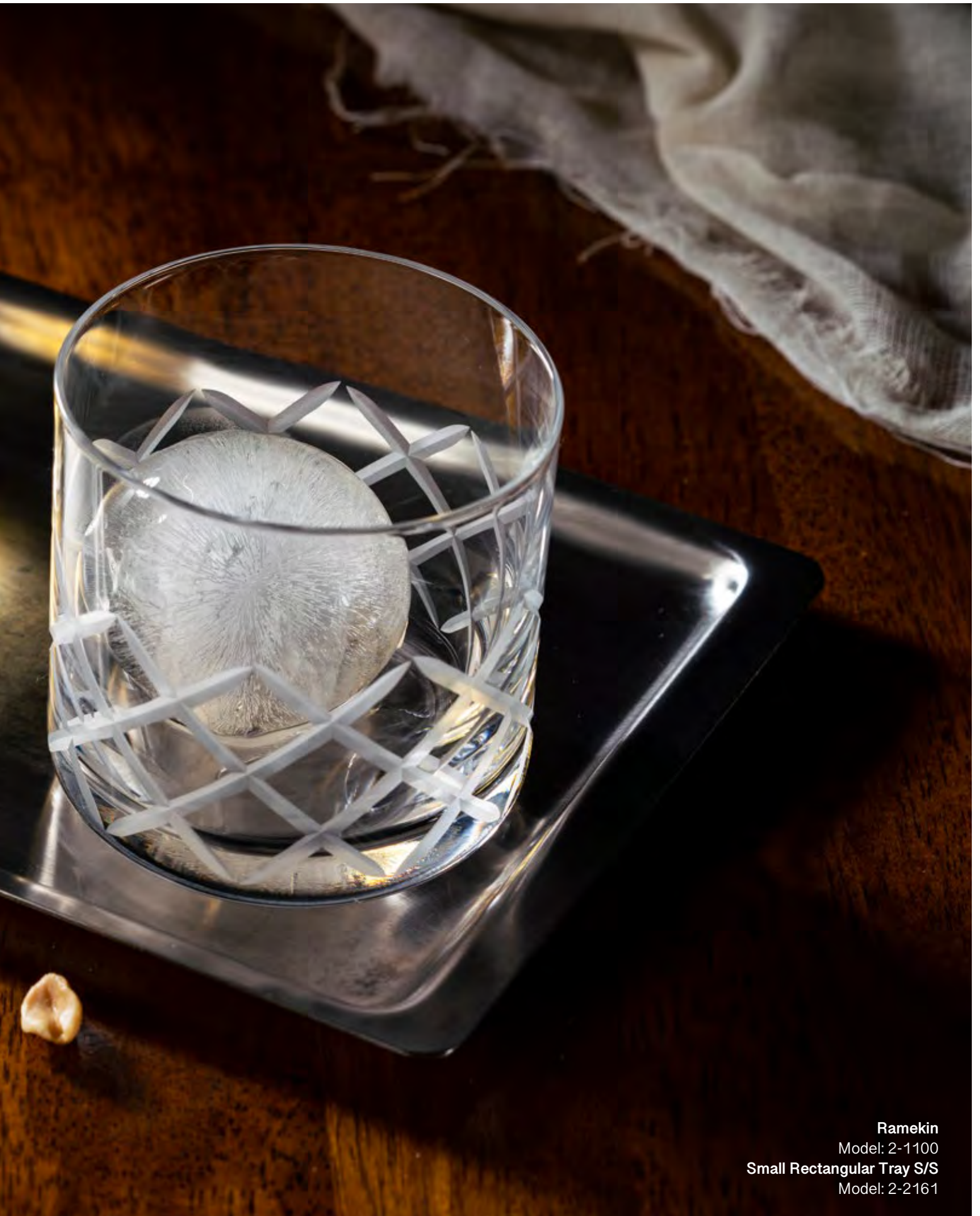
Ramekin Model: 2-1100 Small Rectangular Tray S/S Model: 2-2161