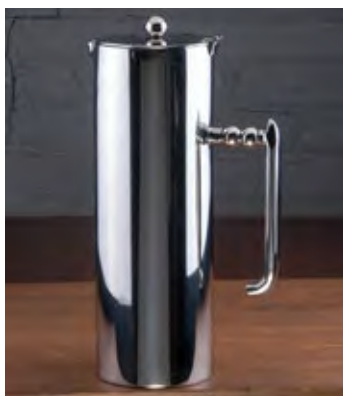
64 oz. Coffee Pot Model: 2-2005