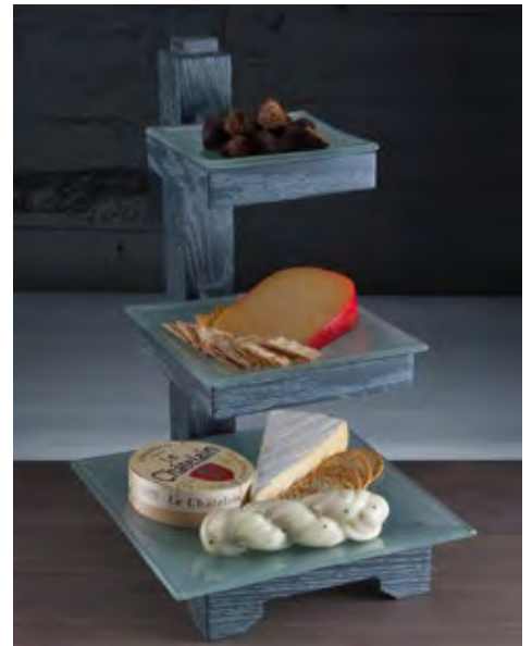
Three Tier Wood & Glass Stand Model: 8-1307 Holds 6", 8", 10" Plates Size: 18 1/2" H