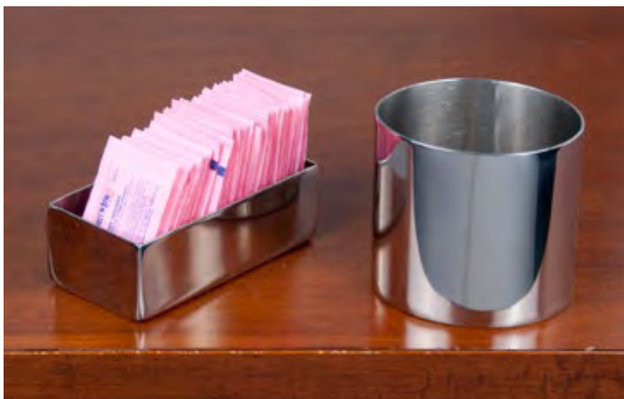
Round Sugar Stick Holder Model: 2-3502, Size: 2" x 2" Rectangular Sugar Pack Holder Model: 2-3500 Size: 4" L x 2" W x 1 1/2" H