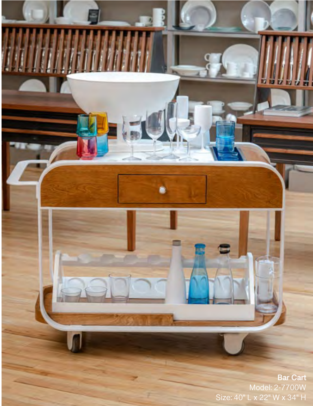
Bar Cart Model: 2-7700W Size: 40" L x 22" W x 34" H

“Create an experience your guests will remember with RCP Design’s custom hospitality carts. Made in the USA, each cart is specifically designed to satisfy your needs and constructed of high quality materials that are built to last. Perfect for wine service, tableside guacamole, desserts and more, these carts are sure to elevate your food service presentation. Steelite International is pleased to partner with RCP Design and proudly represent these eye-catching carts in our showrooms – Chicago, Los Angeles, New York, Washington D.C., and Youngstown, Ohio. Schedule an appointment today to check them out!”