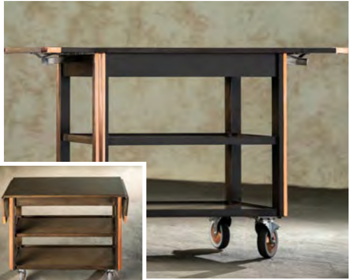
Gueridon w/ Copper Corner Guards Model: 4-2601 Size: 36" L x 16" W x 31" H Overall: 52" L