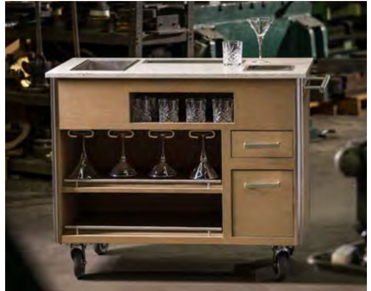
Mixology Cart Model: 2-3587 Size: 40" L x 22" W x 34" H