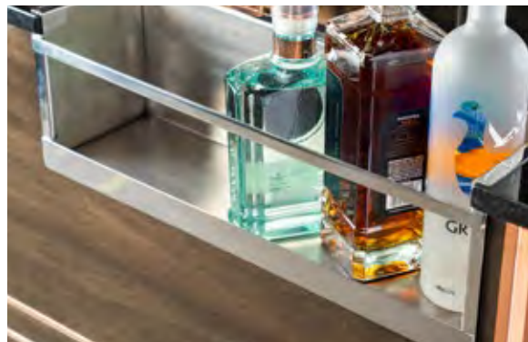
Stainless Steel Custom Speed Rail