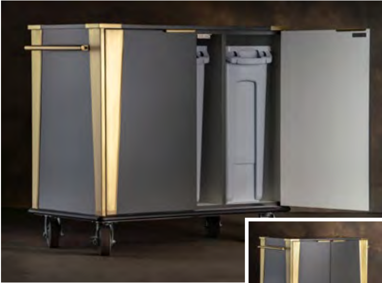
Slim Jim Cart w/ Solid Brass Corners Model: 7-3577 Size: 42" L x 24" W x 42" H