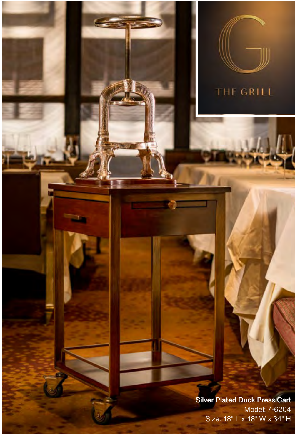
Silver Plated Duck Press Cart Model: 7-6204 Size: 18" L x 18" W x 34" H