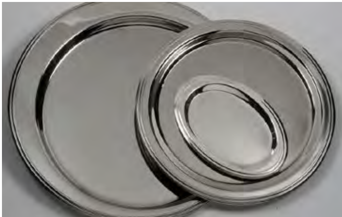
19" Round Tray w/ Offset Flange Model: 2-2101SF 17" Round Tray w/ San Francisco Border Model: 2-1490SF 10" Oval Tray w/ San Francisco Border Model: 2-1510SF *Available in many sizes.