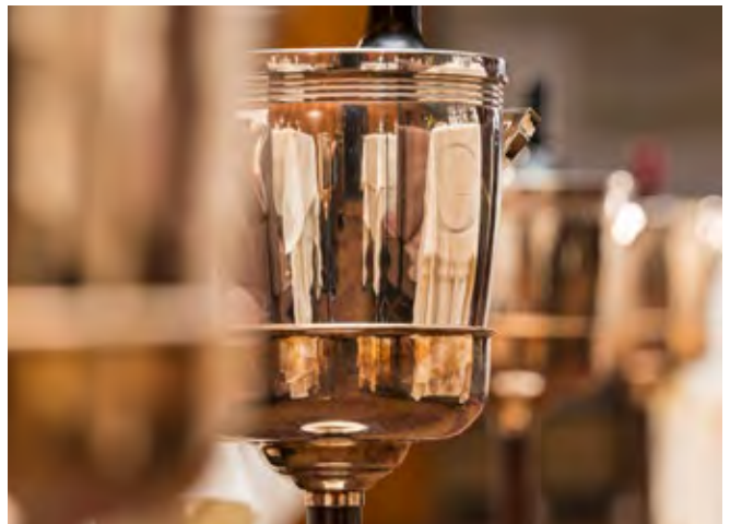
Silver Plated Engraved Wine Cooler Model: 3-4009 Size: 8" D