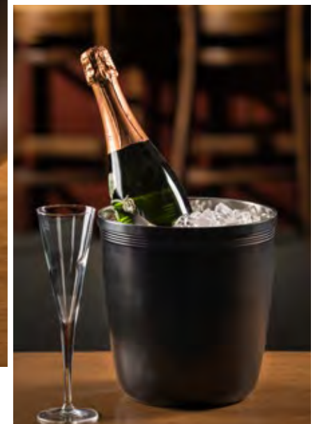
Black Powder Coated Wine Cooler Model: 2-4057B Size: 8" D