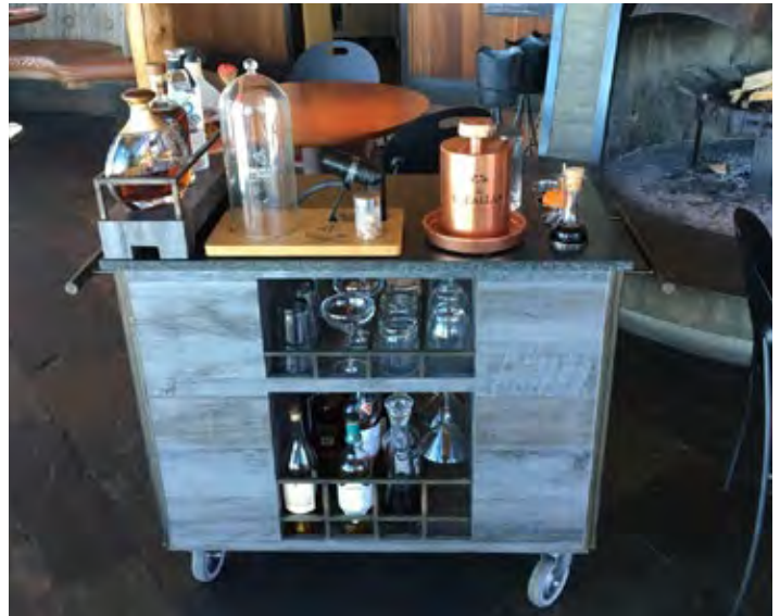
Bar Cart Model: 2-2134 Post Ranch Inn Sierra Mar Restaurant Size: 36" L x 20" W x 34" H