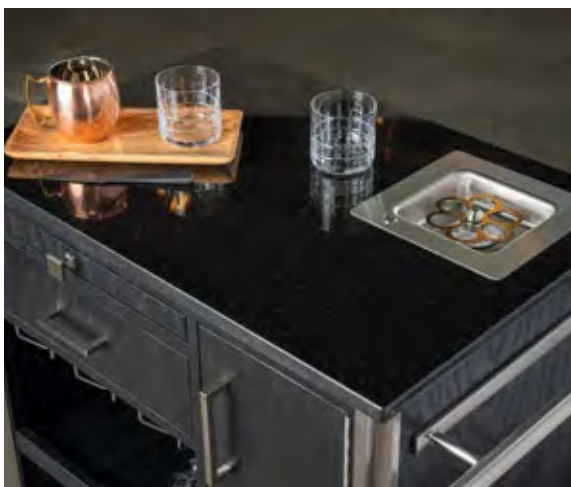
Drop-In model Thrill Machine available.