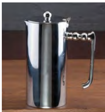
18 oz. Coffee/Tea Pot Model: 2-2002