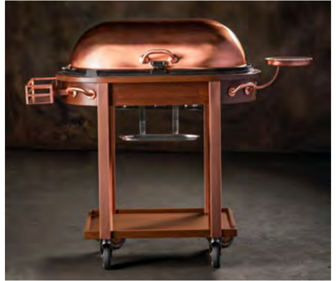
Copper Plated Carving Trolley - Satin Finish Model: 4-0014 Size: 38" L X 24" W x 45 1/2", H Overall: 52" L X 28" W