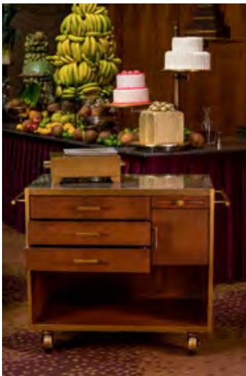
All Purpose Trolley Model: 7-6210 Size: 38" L x 22" W x 35" H