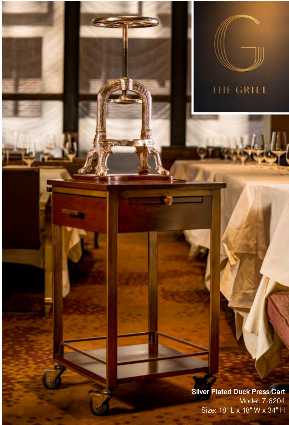
Silver Plated Duck Press Cart