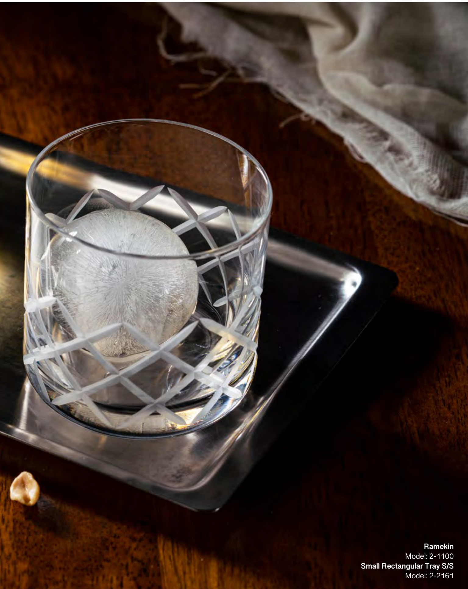
Ramekin Model: 2-1100 Small Rectangular Tray S/S Model: 2-2161