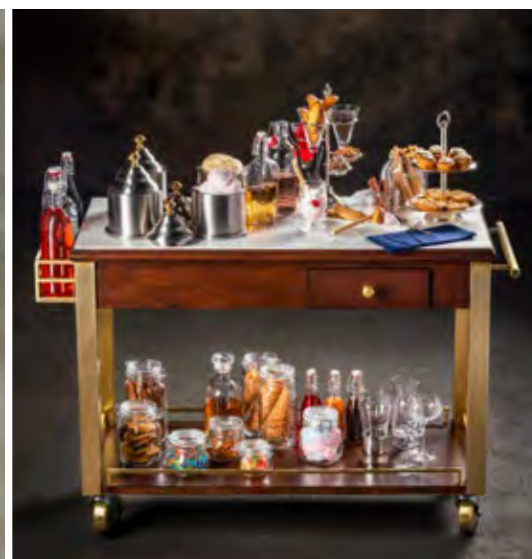
Ice Cream Cart Model: 7-1100 Size: 42" L X 20" W X 33" H Overall 46" L