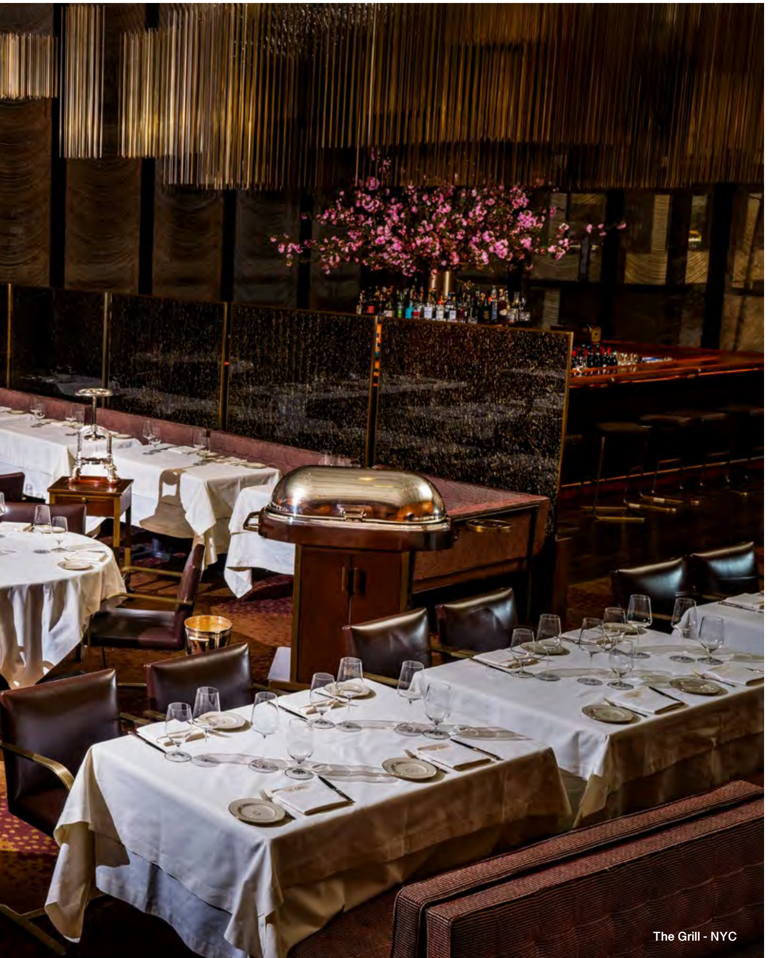
The Grill - NYC