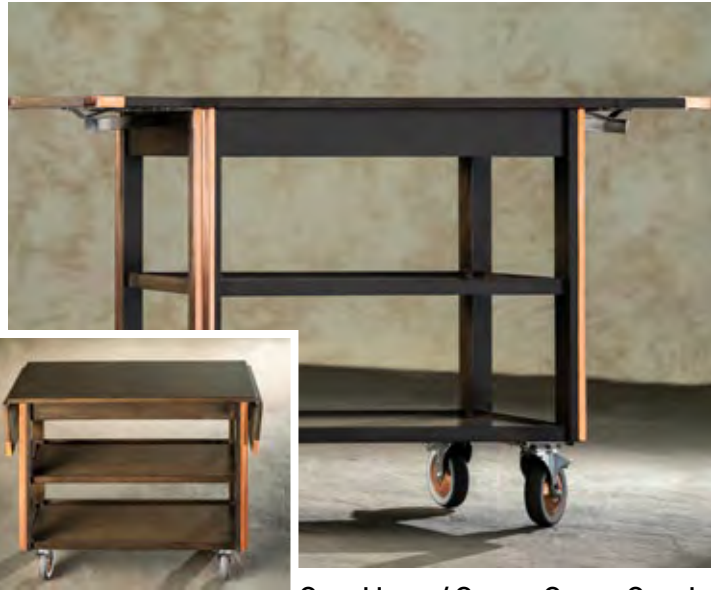
Gueridon w/ Copper Corner Guards Model: 4-2601 Size: 36" L x 16" W x 31" H Overall: 52" L