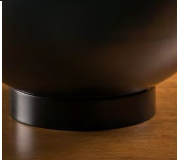
Black Powder Coated Punch Bowl Model: 2-1916-14B Size 14" D