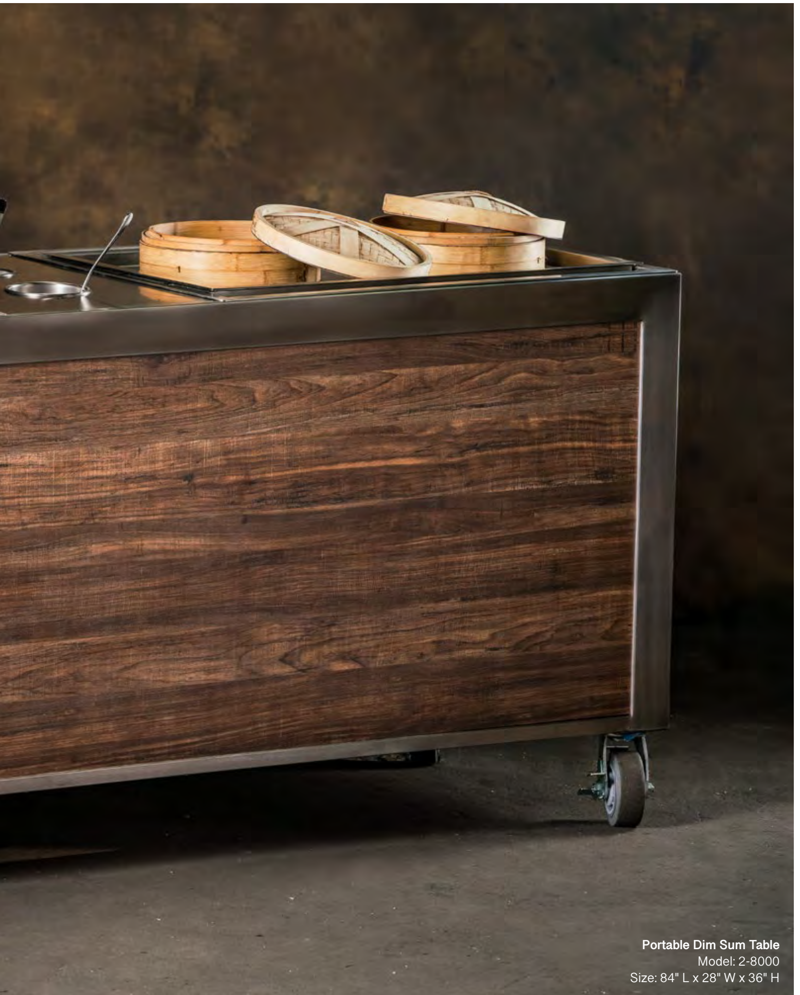
Portable Dim Sum Table Model: 2-8000 Size: 84" L x 28" W x 36" H