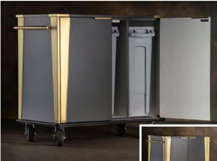
Slim Jim Cart w/ Solid Brass Corners Model: 7-3577 Size: 42" L x 24" W x 42" H