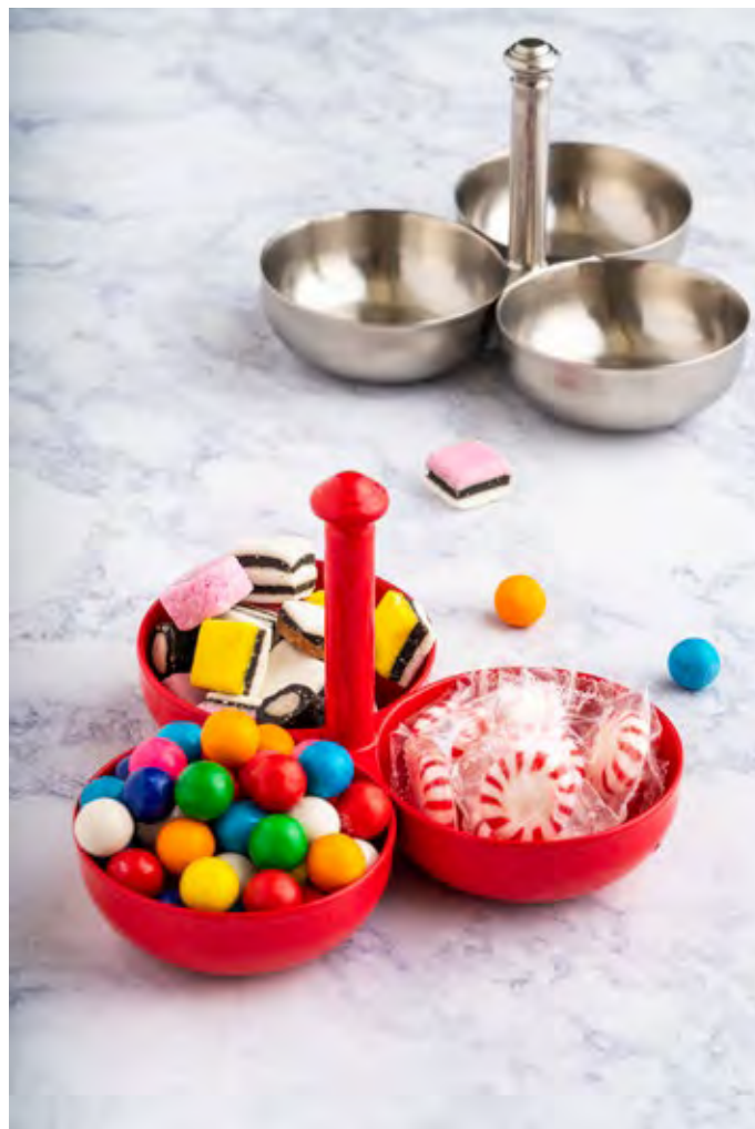
Powder Coated Three Compartment Nut Dish

*All sizes available in custom colored powder coated (with minimum order).