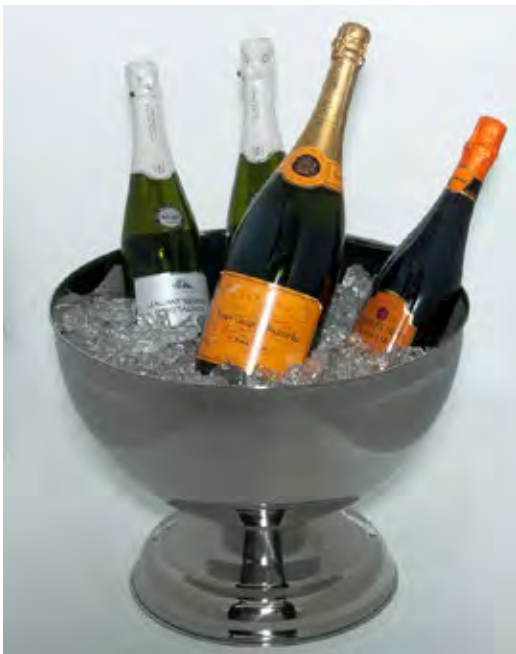
Banquet Punch Bowl Model: 2-1916-16 Size: 16" D