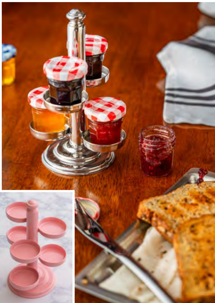
Four Compartment Jam Holder