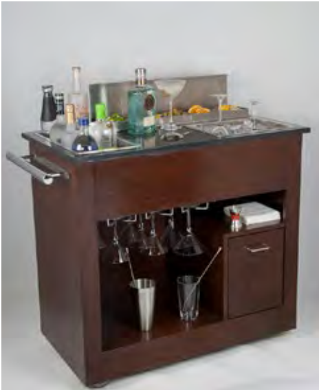
Martini Cart Model: 8-6101 Size: 38" L x 20" W x 34" H