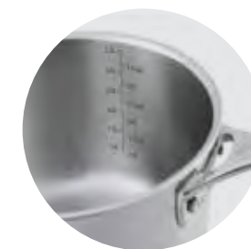
DRIPLESS POURING RIM