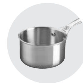
PATENTED STAY-COOL HANDLES