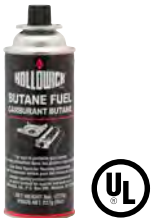
Butane Fuel* BF008 Case: 12

Butane stoves, fuel and accessories are ideal for cooking, catering, and buffet presentations. Hollowick's professional chef torches paired with butane canisters provide high performance heat to create the perfectly crisp crème brûlée, and the butane stoves are convenient and portable to use in foodservice while being cord-free. Dress up your buffet service station with an attractive stainless steel stove cover, which provides proper ventilation, safe no-slip feet, removable grate for easy cleaning and protection from the heating element. Great for both indoor & outdoor use, the butane stoves include a wind guard and protective carrying case for the operator's convenience.