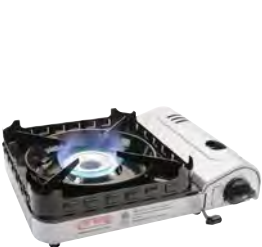
15,000 BTU Portable Stove CMST-15K* L 13.5" (343 mm) W 11.5" (292 mm) H 5" (127 mm)