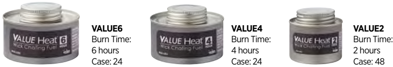
VALUE6 Burn Time: 6 hours Case: 24

Value Heat from Hollowick provides a safe, value conscious solution for food warming. Its non-flammable liquid burns clean without odor and comes in three can sizes: 6, 4 and 2 hour burn time.