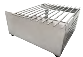
CVR Butane Stove Cover CM-CVR L 14.25" (362 mm) W 12" (305 mm) H 7.2" (183 mm)

* WARNING: This product can expose you to chemicals including carbon monoxide emissions, which is known to the State of California to cause cancer and birth defects or other reproductive harm.