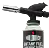
Small Torch* CT100-SNGL Case: 1 CT100 Case: 12