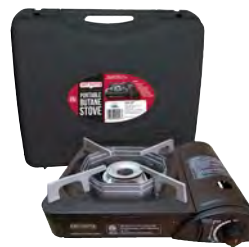
9,000 BTU Portable Stove CMST-9K* L 13.5" (343 mm) W 11.5" (292 mm) H 5" (127 mm)