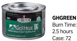
GHGREEN Burn Time: 2.5 hours Case: 72

Gain at least 30 minutes of extra burn time with Hollowick's gel heat chafing fuels. Derived from corn, the eco-friendly ethanol Green Gel Heat is certified by the Green Restaurant Association and provides a consistent, reliable high heat output.