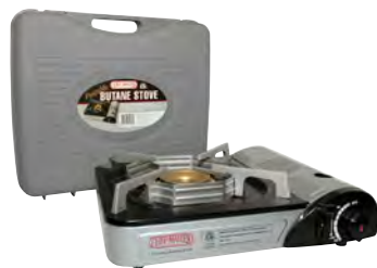
10,000 BTU Portable Stove CMST-10K* L 13.5" (343 mm) W 11.5" (292 mm) H 5" (127 mm)