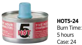
HOT5-24 Burn Time: 5 hours Case: 24

Hollowick Hot 5 is a specifically designed for easy use; simply remove the cap and light. Intended for five hours of burn time, Hot 5's fuel can is safely sealed, therefore the can is safe & cool to handle at any point.