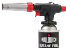
Large Torch* CT200-SNGL Case: 1 CT200 Case: 12